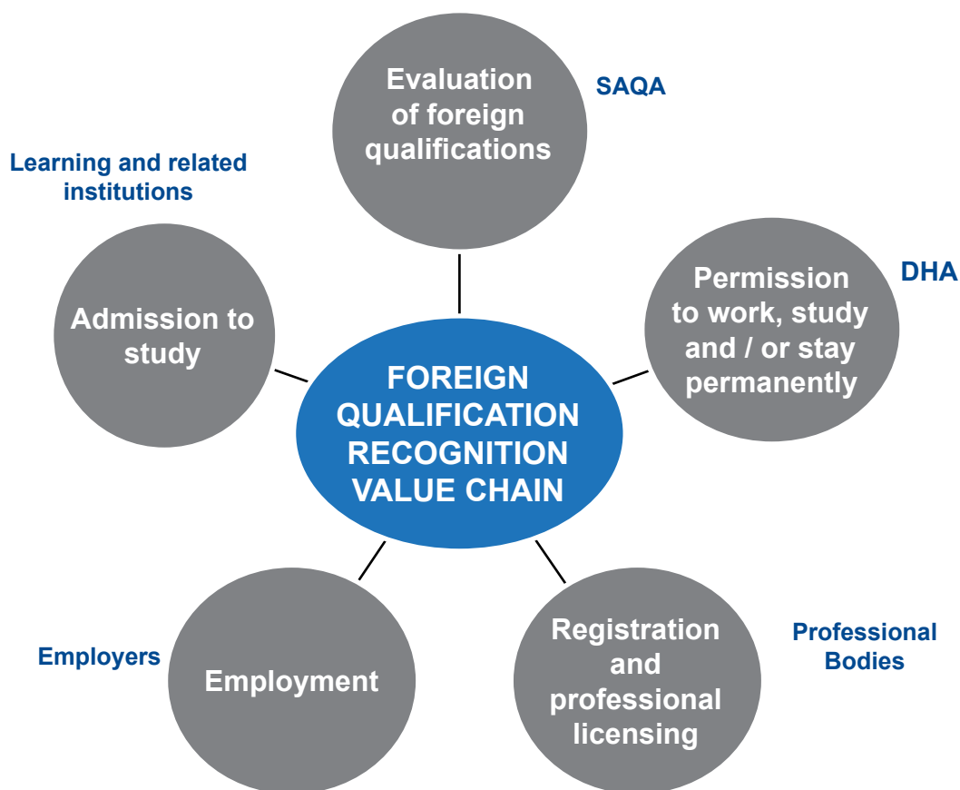
Figure 2: The Recognition Value Chain for foreign qualifications